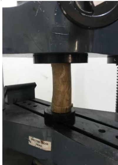
Figure 6. UTM machine