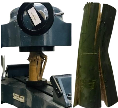
Figure 8. (Failure of bamboo).