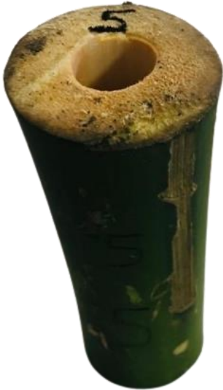
Figure 3. Specimens from different section of bamboo