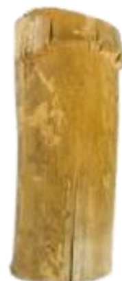
Figure 2. Specimens from different section of bamboo