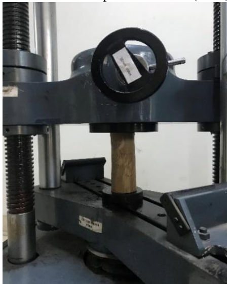
Figure 5. UTM machine.

where \sigma_c : compressive stress (MPa), F_m : maximum load, A : cross-sectional area