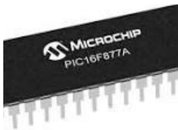
Figure 4. PIC Microcontroller.