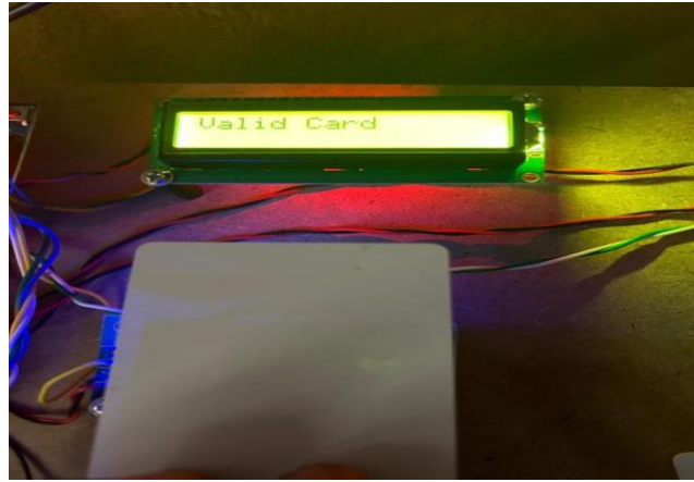
Figure 3 (a), (b), (c) : LCD screens