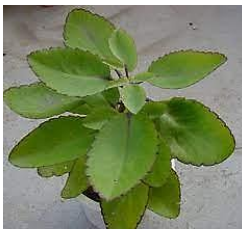
Figure 1. Plant of Bryophyllum pinnatum .

first found in Madagascar and has since spread to portions of Asia, Australia, and New Zealand, among other places [1]. The metabolic abnormalities that characterize diabetes are caused by insulin resistance, which primarily affects tissues like the liver, adipose tissue, and skeletal muscles. Type 1 diabetes is an autoimmune illness that gradually worsens and affects about 1% of people in the developed world. This detrimental immune response is brought on by a confluence of environmental variables and genetic predisposition [2, 3]. The Bryophyllum pinnatum (Figure 1) plant is a succulent perennial species with a hollow, four-angled stem that is commonly branched, and a normal height of 1 to 1.4 meters. The opposing, succulent, decussate leaves are 10–21 cm long. Kalanchoe pinnata has simple bottom leaves and compound top leaves with three to six leaflets on long petioles. With four to six leaflets per blade, the pinnately compound leaf blades range in length from 11 to 32 cm. The individual leaflets are oblong to elliptic in shape, measuring 6–7 cm by 3–4 cm, while the petioles are 2–3 cm long. The leaves have crenate margins, with a latent bud in each notch. The terminal, panicle inflorescences have a length range of 10 to 42 cm (Table 1). The traditional usage of Kalanchoe pinnata leaf extracts in folk medicine can be explained by the presence of several phytochemicals with unique biological activity [4, 5].