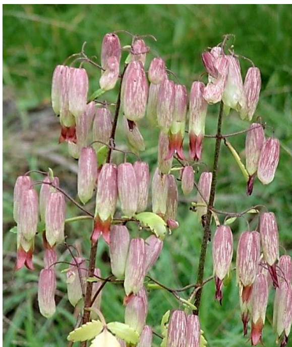
Figure 2. Flowers of Bryophyllum pinnatum .

A panicle with several dangling, reddish-orange blooms is the terminal inflorescence. The calyx is a long tube with four small triangular tips at the end. It is deep red at the base and has veins of yellowish-green or green with reddish-brown spots. Four 5 cm-long lobes terminate the tubular corolla, which has a noticeable constriction between the ovoid and subspherical portions. It has streaks of reddish-purple and a yellowish tint (Figure 2). The eight 4 cm long stamens are fused onto the corolla in two whorls. The ovary has four slender carpels that are partially connected at the center [7].