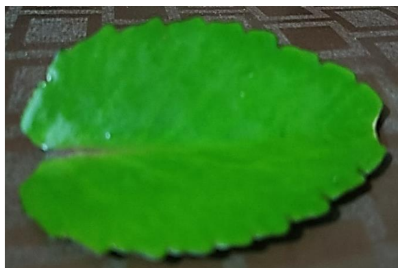
Figure 5. Leaf of plant Bryophyllum pinnatum .