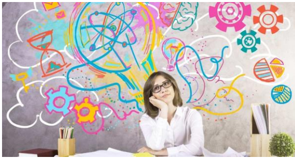
Figure 6. Impact of Creativity In Any Brainstorming Task.