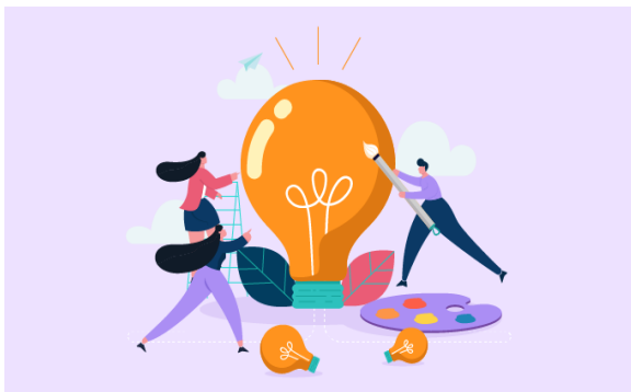
Figure 4. Creativity, collaboration, and well being.

The work of renowned interior designer Kelly Wearstler exemplifies creativity in interior design. Wearstler's bold and eclectic style, characterized by unexpected combinations of colors, patterns, and textures, showcases the power of creativity to transform spaces into works of art.