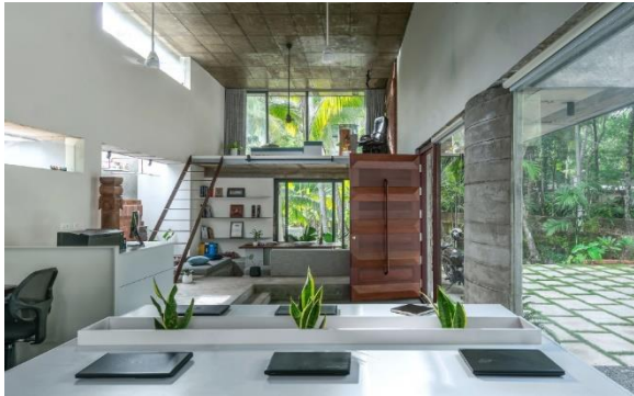
Figure 9. Varied seating options present in the office.

materials. The way the indoor and outdoor areas are contrasted makes them blend into one another, giving the impression of an open office and making the space a motivating destination for guests.