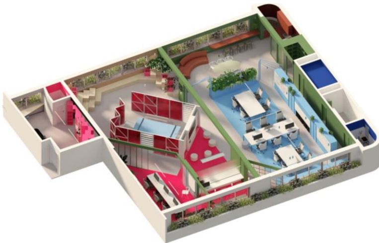
Figure 11. Varied Flexible Working Spaces

In many of Moca's projects, (Figure 11) colors have played a pivotal role in delineating spaces and shaping the personality of the environment. In this particular project, careful consideration was given to how light and color interacted within the space, especially with regard to specific lighting that wouldn't distort or interfere with printing tests and product development processes. This ensured that the chosen colors and lighting scheme would support the agency's work without compromising the accuracy of their creative outputs.