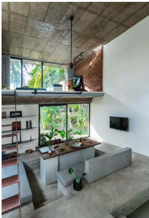
Figure 8. Office varying from a traditional working setup.

Innovation: The building's east-west linear orientation and the apertures that border its 5 m width allow natural lighting and cross ventilation to change the mood of the area constantly. The building's fifteen meters of east light in the morning passes straight through, and the dawn light does the same with the west light.