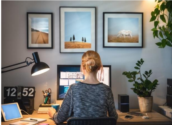
Figure 1. Traditional work setup (Chair, Desk and Laptop).

sedentary work can negatively impact physical health and overall job satisfaction. On the other hand, a designer who operates in a flexible and creatively stimulating space experiences numerous advantages [2]. By having the freedom to work on a couch, bean bag, garden swing, or within an environment designed to ignite creativity, this designer benefits from enhanced inspiration and motivation. The varied surroundings stimulate different brain parts, leading to more innovative thinking and problem-solving. Working in diverse spaces also fosters adaptability and a willingness to explore new ideas.