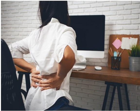
Figure 5. Constraints of Traditional Work Setup.