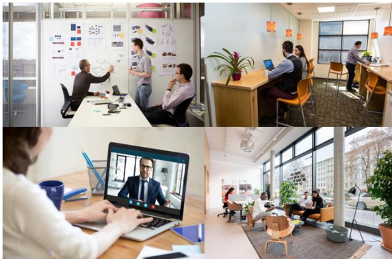
Figure 3. Traditional to Innovative to Remote and Flexible Workspace.

Interior designers often find themselves working in traditional office environments characterized by cubicles, desks, and standard office furniture. This setup can sometimes limit creativity and collaboration due to its rigid structure. Designers may feel confined to their desks, which can impede the flow of creative ideas. For example, In many design firms, interior designers typically work at assigned desks with minimal flexibility in terms of workspace layout. This setup may not provide the variety and stimulation needed for optimal creativity.