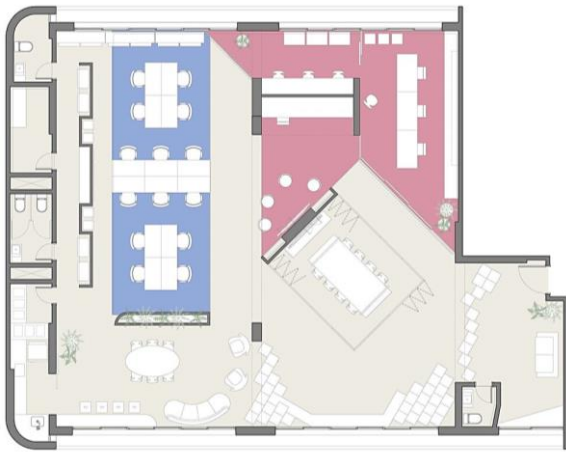
Figure 10. Plan of MAD Creativity Agency office.