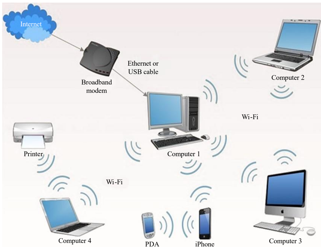
Figure 2. Ad-Hoc connection attack.