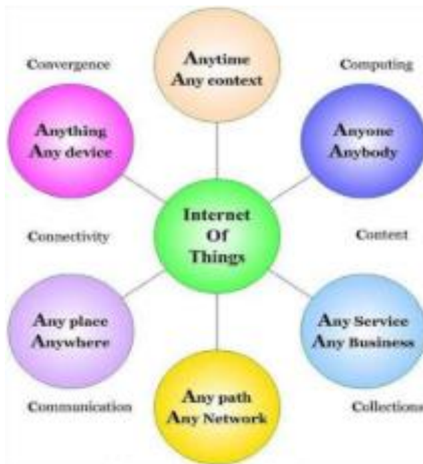
Figure 1. IoT Representation.

The Internet of Things (IoT) makes it possible for objects to be sensed or controlled remotely over already-existing network infrastructure. This opens possibilities for a more direct integration of the physical world into computer-based systems, which can lead to reduced human intervention and improvements in efficiency, accuracy, and economic benefit. The Internet of Things (IoT) can be enhanced with sensors and actuators to form part of a broader class of cyber physical systems, which includes virtual power plants, smart homes, smart cities, and smart grids. Using its embedded computer system, each object has a unique identity, but it can still communicate with the current internet infrastructure [10]. Representation of IoT system is shown in Figure 1.