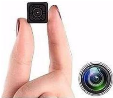
Figure 1. Camera.