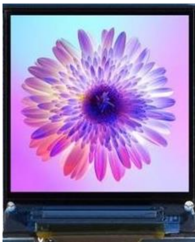
Figure 3. Display screen.