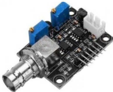
Figure 2. Ph and temperature sensor.