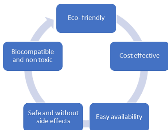
Figure 2. Advantages of herbal excipients.