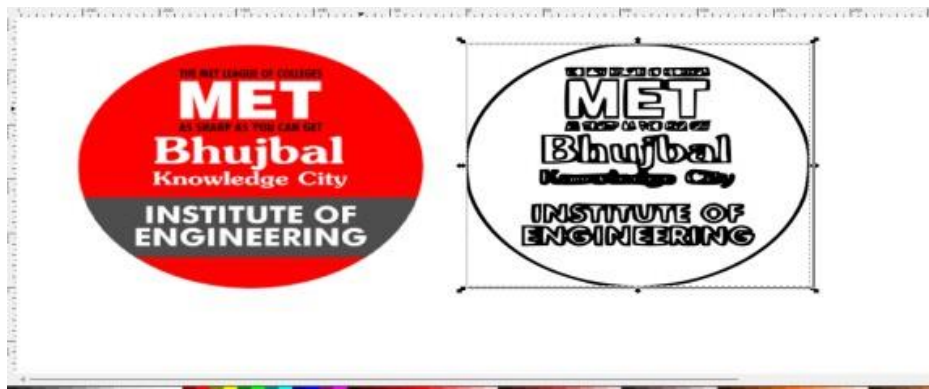
Figure 3. Simulation using Inkscape.