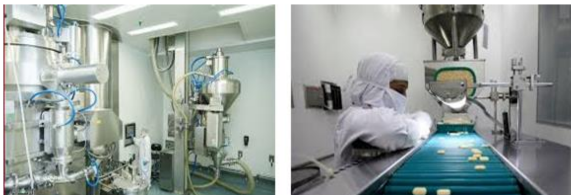
Figure 2. Chemical factory for the recycling of chemical drugs.

In another stage, the grains were crushed into a powder, and the tests showed little leakage within ten days. The organization is working on developing a mechanism that includes aluminum in medicines, which limits the leakage process and makes it impossible. The manufacturing process and the results of the leakage tests in the process of including expired drugs in the plastic electrical distribution panels show success, especially in the absence of drug substances from the panels even in the event of an acceleration of the degree Celsius. Figure 2 depicts a chemical factory for recycling of chemical drugs.