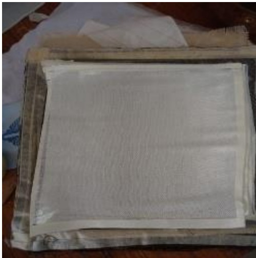
Figure 1. Unidirectional glass fiber

Material Selection: The composite has been reinforced using carbon and glass fibers based on their remarkable strength and pliability. The epoxy resin has been used as matrix material because of its strong adhesiveness and endurance to environmental effects [11]. This matrix-fiber hybrid achieves the maximum compromise among mechanical strength, low weight properties, and durability to environmental exposure [12–14]. Figure 1 shows unidirectional glass fibers cut into 300 x 300 mm. The specific geometric specifications and physical dimensions for the test specimens used in this study are detailed in Table 1.