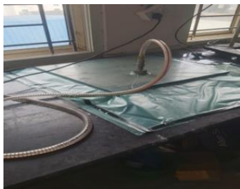
Figure 5. Vacuum bag