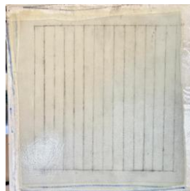
Figure 6. Sample Cutting

Experimental Setup: Impact Testing- Drop-weight impact tester used for low-velocity impacts. Impact energy levels: 20J,40J. A drop-weight impact tester was used for low-velocity impacts at energy levels of 20J and 40J. A Universal Testing Machine (UTM) was used for the test of residual tensile strength. The physical condition of the specimens immediately following the impact event is captured in Figure 7, showing the localized damage areas.