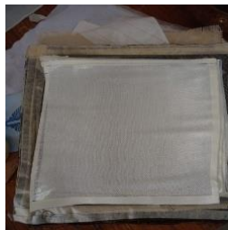
Figure 2. Unidirectional glass fiber

The material preparation can be briefly observed in the below figure 2,3,4,5,6. Dimensions- tape size = 5 cm each, Sample size = 150 mm, thickness = 0.8 mm, width = 15 mm, total length = 250.