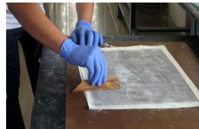
Figure 4. Layering