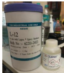
Figure 3. Resin & Hardener