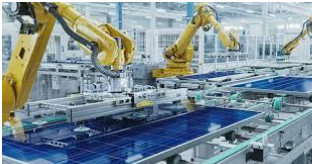
Figure 1. Manufacturing through robotic arms.

Cobots' accessibility is one of the factors contributing to their quick uptake. Collaborative robotics is now feasible for small and medium-sized businesses thanks in large part to companies like Universal Robots. Cobots are typically simpler to install, program, and redeploy than standard industrial robots, which can call for intricate integration and significant financial outlays. A lot of models include user-friendly interfaces that make it possible for operators with no programming background to set up jobs. This lowers the barrier to entry for automation and makes it possible for smaller enterprises to take use of robotic support without completely changing their production system (Figure 2).