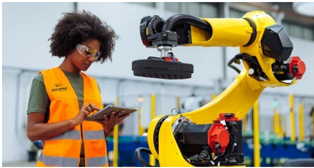
Figure 2. Cobots.

Technically speaking, cobots have sophisticated force and torque sensors and real-time control algorithms that keep an eye on interaction forces. To avoid harm, the device can instantly slow down or halt if unexpected contact is detected. Certain designs include force and power limitation mechanisms to prevent the robot from applying forces that exceed safe limits. Awareness of the surroundings is further improved by proximity sensors and vision systems. Because of these features, cobots can perform a variety of jobs with a high degree of operational safety, including light assembly, packing, machine tending, and quality inspection.