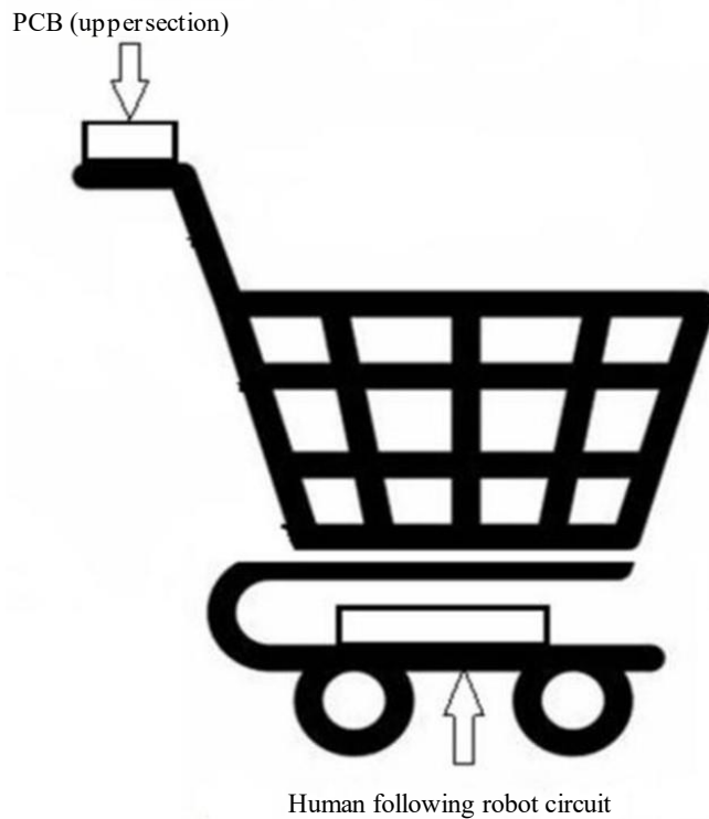
Figure 2. Trolley.