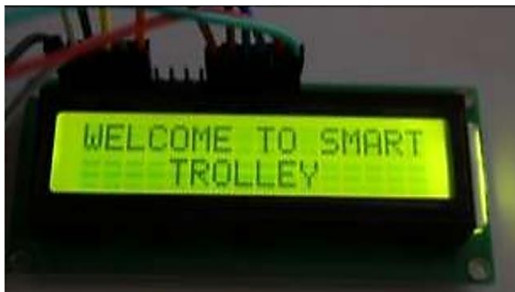
Figure 4. Message display.