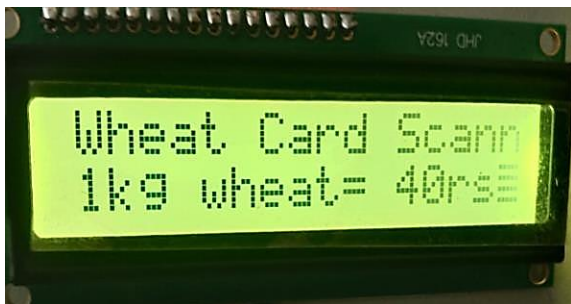
Figure 6. Price display.