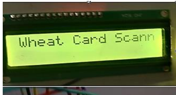
Figure 5. Product scanned.