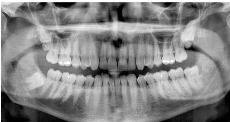
Figure 1. Panoramic radiographic image.

Neural networks with graph structure (GNNs) can be trained to process and analyze graph-structured data. An edge-and-node data structure is called a graph. The nodes represent entities, such as teeth or dental diseases, and the edges represent relationships between the entities. GNN can be used to develop accurate and efficient systems for object detection, localization, classification, and relationship prediction [3].