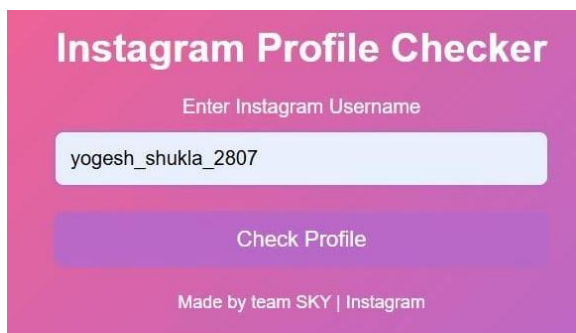
Figure 2. Profile checker.

{ "profile_data": { "bio": "Lucknow \n जय श्री राम ", "followers": 66, "following": 64, "posts": 11, "profile_picture": "https://instagram.flko10-1.fna.fbcdn.net/v/t51.2885-19/453458722_1826686791192222_1916661173605110706_n.jpg?stp=dst-jpg_s320x320_tt6&nc_ht=instagram.flko10-1.fna.fbcdn.net&nc_cat=106&nc_ohc=MdF9fAxJ0WYQ7kNvgHKbwa7&nc_gid=e30c1fee77f743a1ba026a685c3ac609&edm=AQ01c0wBAAAA&ccb=7-5&oh=00_AYCY4o6RLyyC00LYEQKKNVCPq9KheD8iimYHcJK9mg143g&oe=679CF327&nc_sid=8b3546", "username": "yogesh_shukla_2807" }, "result": "legitimate" }