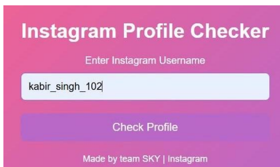
Figure 4. For fake account

"profile_data": { "bio": "", "followers": 3, "following": 1, "posts": 0, "profile_picture": "https://instagram.flko9-2.fna.fbcdn.net/v/t51.2885-19/334102858_131508759640966_3084321567039020856_n.jpg?tp=dst-jpg_s320x320_tt6&nc_ht=instagram.flko9-2.fna.fbcdn.net&nc_cat=110&nc_ohc=xWRfnJgTcVAQ7kNvgGvjbn7&nc_gid=b928752c8f734640ad87928a22dff504&edm=AQ01c0wBAAAA&ccb=7-8&oh=00_AYDuDB1bmZs-0FqM4WxhwPmjtdo-QHRuTMubWe3x6CNw&oe=679CFC04&nc_sid=8b3546", "username": "kabir_singh_102" }, "result": "fake"