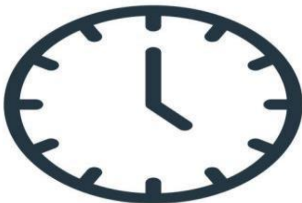
Figure 2. Timeline and challenges in E-Highway implementation on the Delhi–Jaipur corridor.