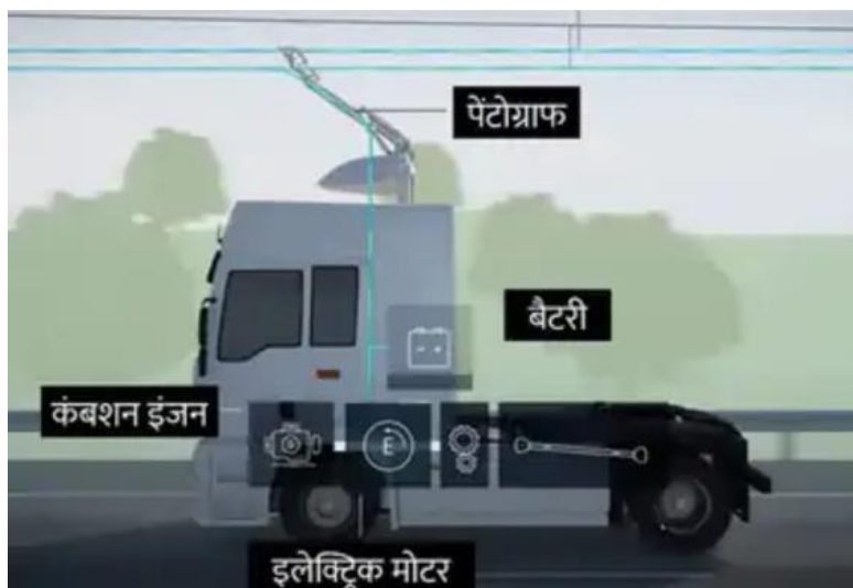
Figure 5. Components of an E-Highway system: overhead wires, pantograph, and substation, alongside an operational E-Highway bus.