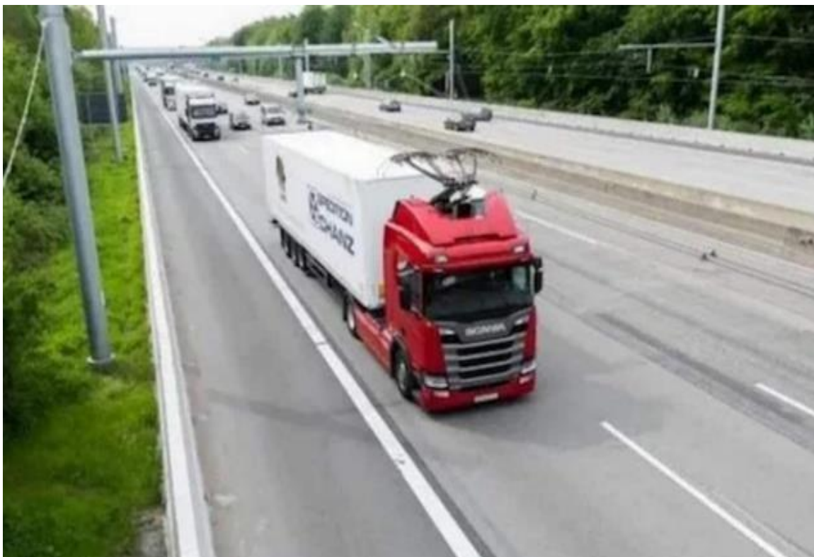
Figure 1. Infrastructure challenges in retrofitting highways with E-Highway technology.

This collaborative approach will play a pivotal role in overcoming challenges, maximizing benefits, and ensuring the successful implementation of E-Highway technology in India Figure 2.