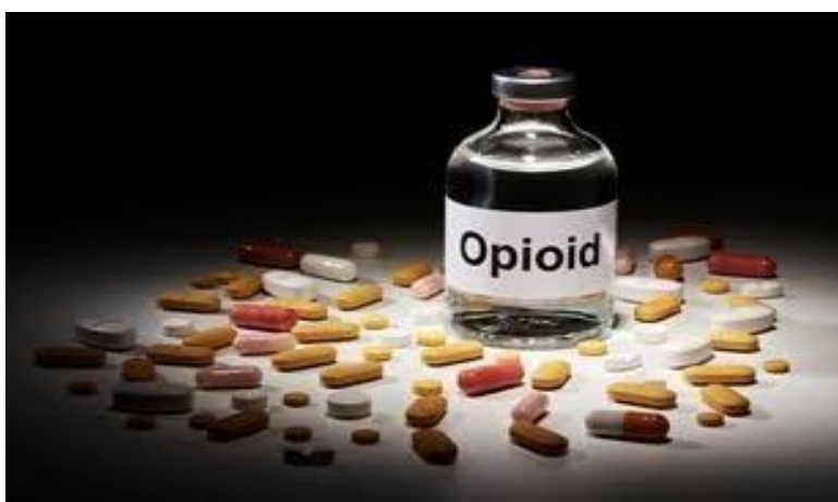
Figure 5. Opioid.