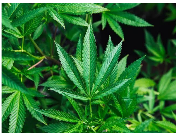
Figure 2. Marijuana.

In India, among young adults, alcohol is also increasingly being used as a drug of abuse. And the largest rate of alcohol consumption is among adults. Alcohol use in college student is higher than the non-college. 60% are from the college student and 56.4 from non-college [11]. Currently in India, 14.6% of population of people using alcohol in between the age of 12 to 25 years. Among young adults, has increased rate 79.3% at age group of 25 to 60 and Indian adults age group of 12 to 19 has a rate of 38% of use. Almost 40 to 43% of school children’s consuming the alcohol. In men 15.9% and in women 17.7% family consumption is the factor taking alcohol among children and adolescents Figure 3.