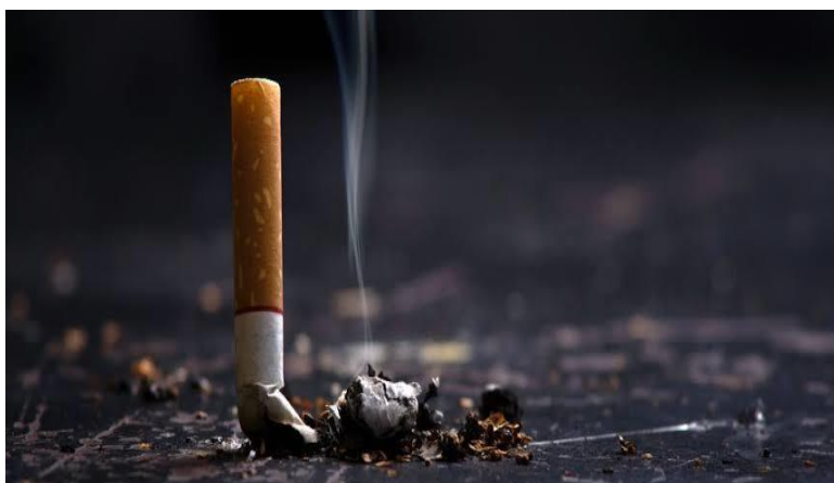
Figure 4. Cigarette.

Among the illicit drug the percentage of drug use showed that alcohol and marijuana have highest amount of use between 10th grade and 12th grade. It estimates the substance use among young youth and adults (Table 1).