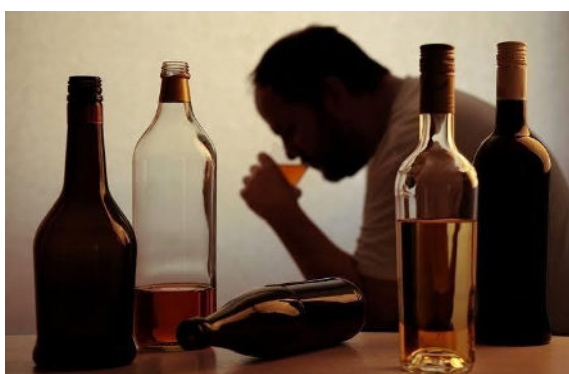
Figure 3. Alcohol.