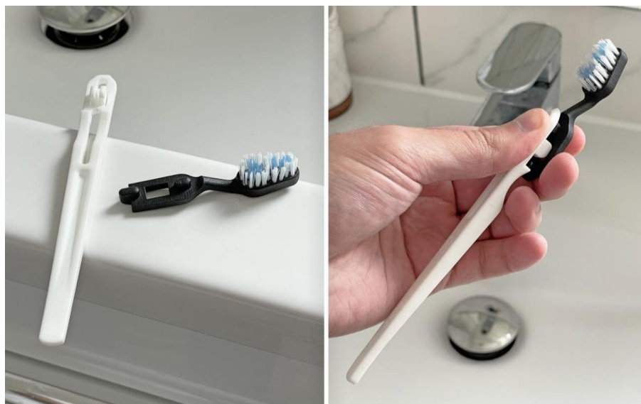
Figure 1. Conceptual proposed idea.

This study focuses on modular toothbrush systems with reusable handles and replaceable bristle heads and explores their potential to reduce plastic waste and carbon emissions. The novelty lies in the integration of LCA with behavioral analysis, bridging the gap between technical feasibility and consumer adoption in sustainable product design [4].