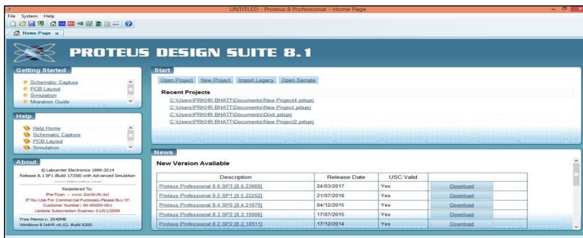
Fig 9. Proteus software (8.14)

Proteus Software version 8.14 continues the legacy of being a comprehensive electronic design automation (EDA) tool, widely utilized for circuit simulation and PCB design. This iteration likely retains the core features that have made Proteus popular among engineers and designers. With a voltage range of capabilities, Proteus supports circuit simulation, enabling users to design and test electronic circuits virtually before physical implementation. The software is known for its microcontroller simulation capabilities, aiding in the development and testing of embedded systems. PCB design is a key strength, allowing users to create and optimize the layout of printed circuit boards. Proteus boasts an extensive library of electronic components, facilitating the design process by providing a wide array of pre-modeled components for use in projects. Additionally, the software often features virtual instrumentation tools, allowing users to incorporate virtual oscilloscopes, function generators, and other instruments into their simulations. For microcontroller-based projects, Proteus offers code visualization and debugging tools, streamlining the development of embedded software. This is in Fig 9. Proteus software (8.14). While specific details about version 8.14 may require checking the official documentation, users can expect an advanced and versatile tool for electronic design and simulation.