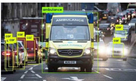
Figure 2. Emergency Vehicle Detection.