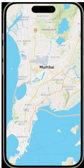
Figure 4. Figma map integration.