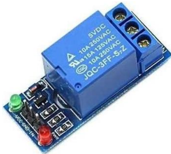
Figure 12. Relay driver.