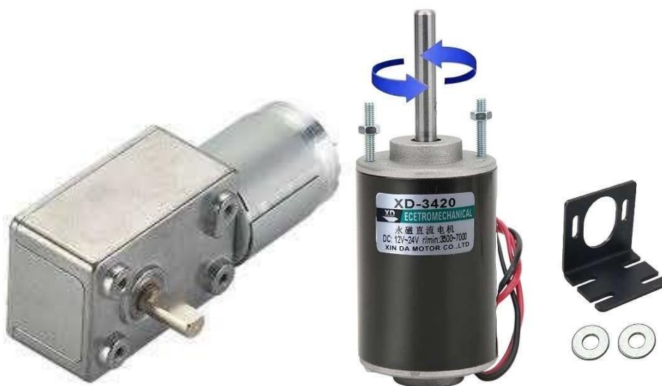
Figure 10. DC motor.