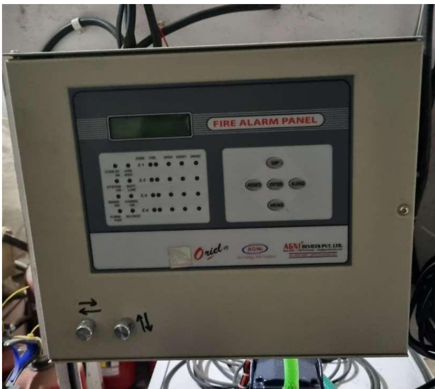
Figure 4. Fire alarm panel.