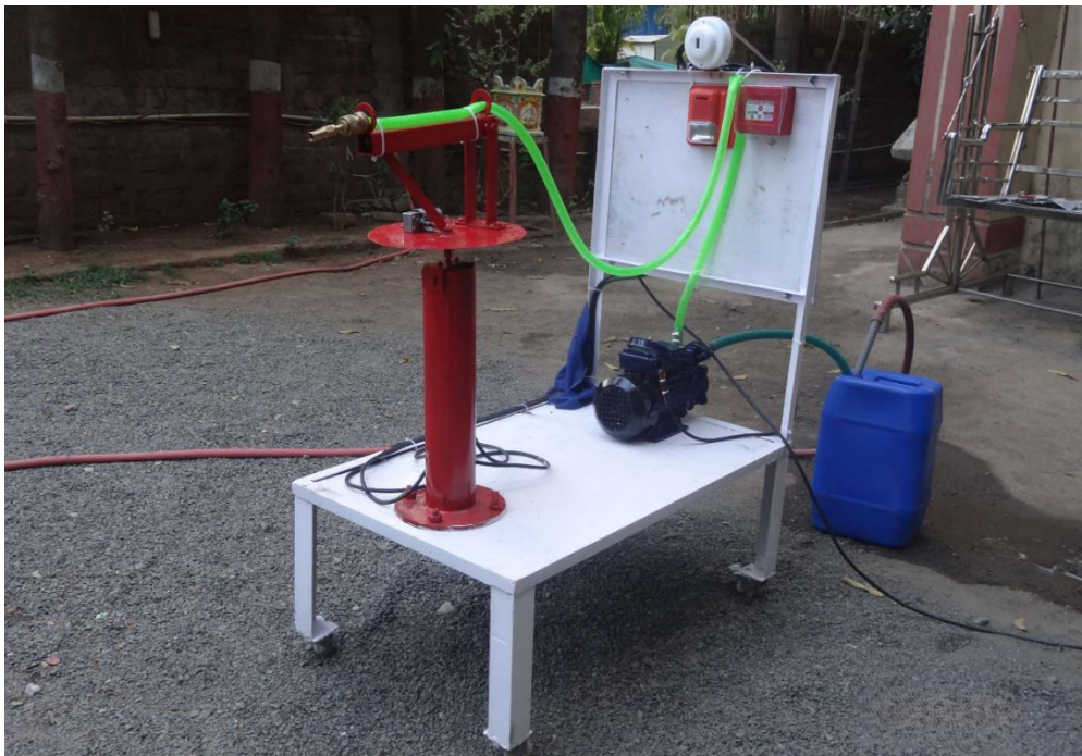
Figure 1. Fabricated Model of 360-Degree rotating fire protection system.

Exploring the challenges and opportunities of integrating 360-degree rotating fire protection systems existing traditional fire protection systems, alarms, emergency response and overall safety measures. Accessing the environmental impact of 360-degree fire protection systems, including their energy consumption, use of resources, and potential emissions and exploring it improves every aspect through technology.