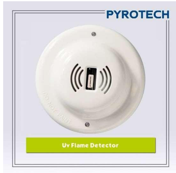
Figure 3. UV flame detector.