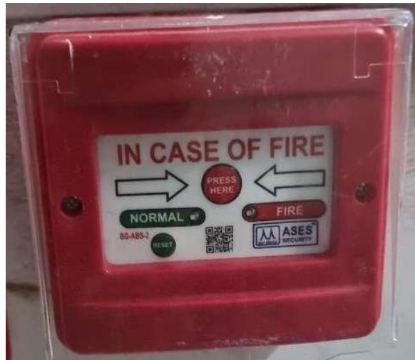
Figure 6. Manual Call Point.