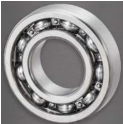
Figure 7. Bearing.