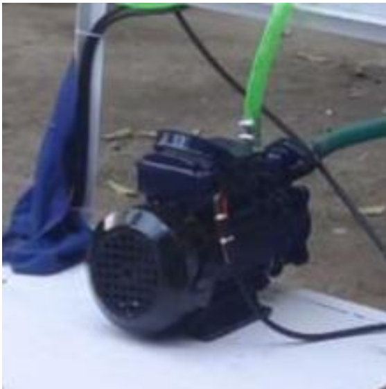
Figure 2. Water pump.