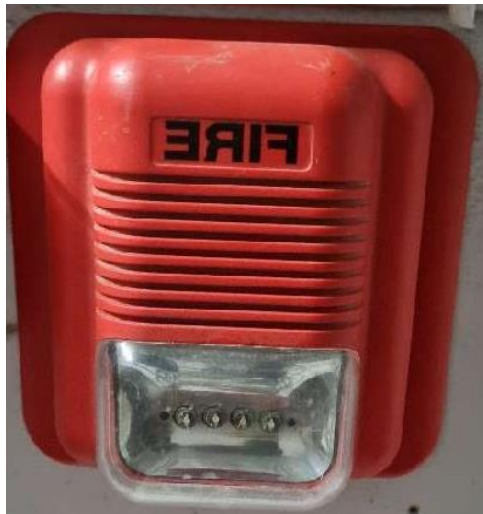
Figure 5. Fire hooter.