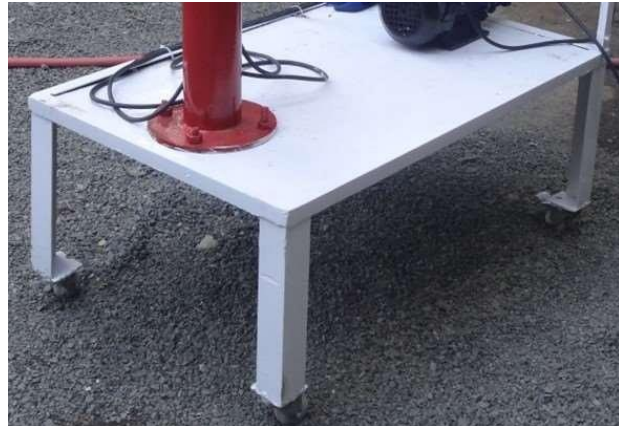
Figure 8. Base frame.