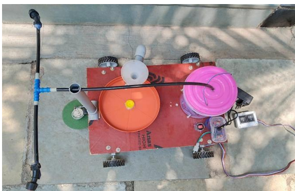
Figure 2. Solar-powered agricultural robot.