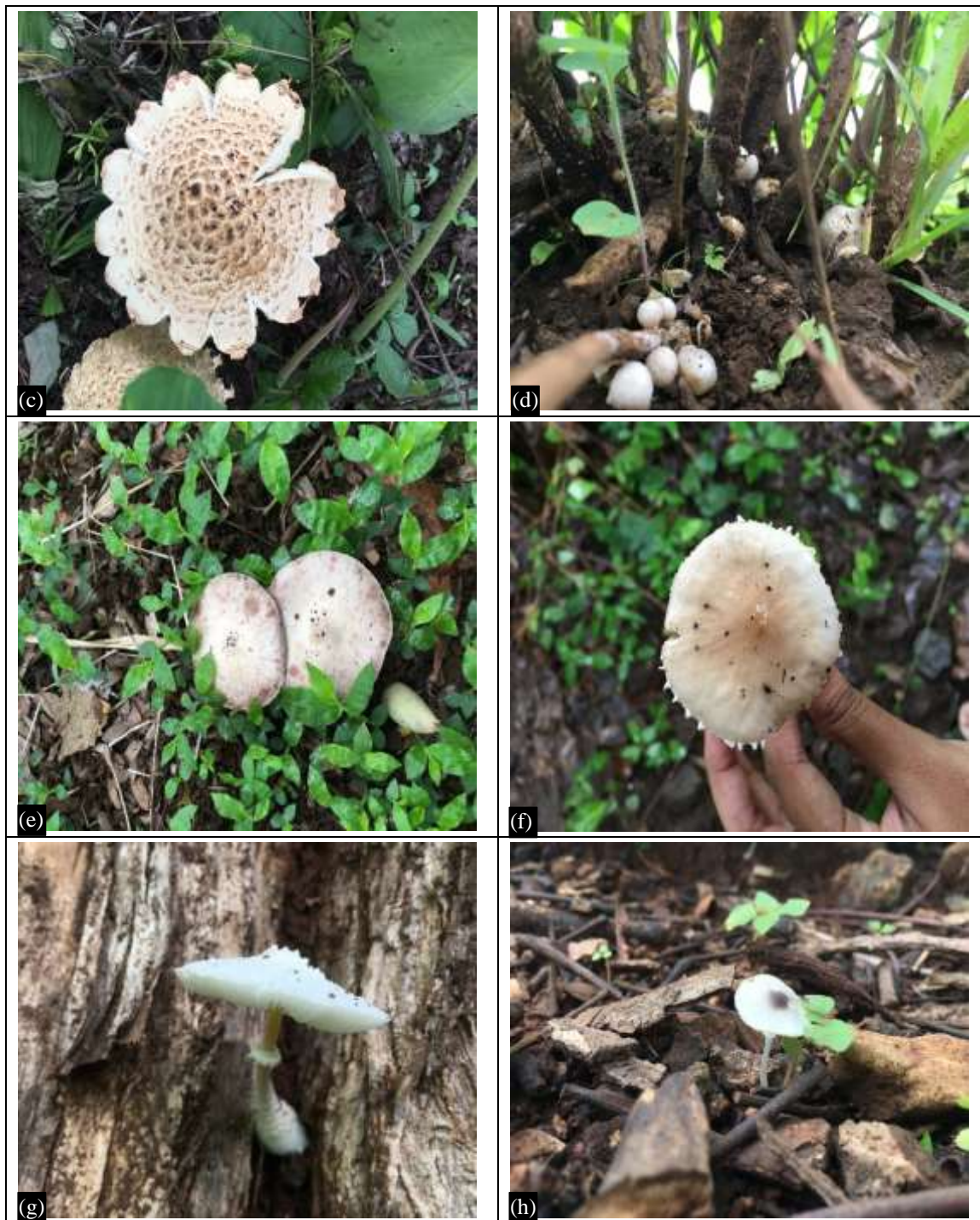
Figure 2. (a) Agaricus dulcidulus , (b) Lepiota cristata , (c) Lepiota procera , (d) Bovista pusilla , (e) Agaricus brunneolus , (f) Lepiota erminea , (g) Chlorophyllum molybdites , (h) Leucoagaricus melanotrichus