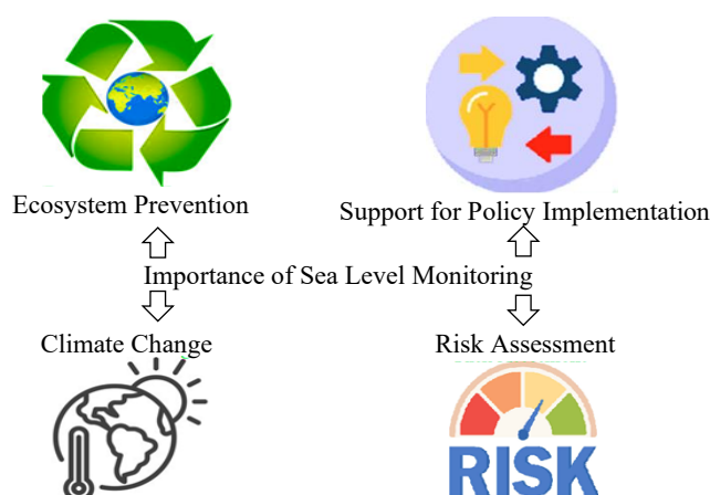
Figure 1. Sea Level monitoring Importance.

Satellite sensing is changing the way we keep an eye on the rise in sea level, which is giving us important information about how climate change is affecting the world. As we continue to work on and improve this technology, we are learning more about the problems that lie ahead and the steps we need