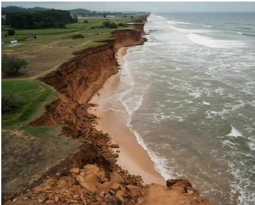
Figure 2. Sea Level study.