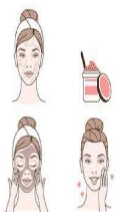
Figure 7. Step-by-step facial mask routine for glowing skin.