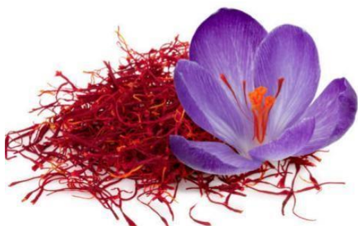
Figure 4. Saffron.

Sandalwood oil or paste is a versatile ingredient for face masks, addressing various skin concerns. For dry skin, combine sandalwood paste with honey to create a deeply moisturizing mask (Figure 5). To reduce excessive tanning, mix it with cucumber, lemon, and yogurt before applying liberally [19].