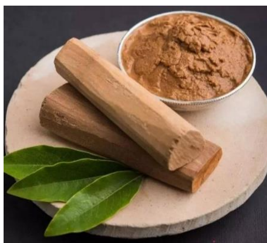
Figure 5. Sandal wood.