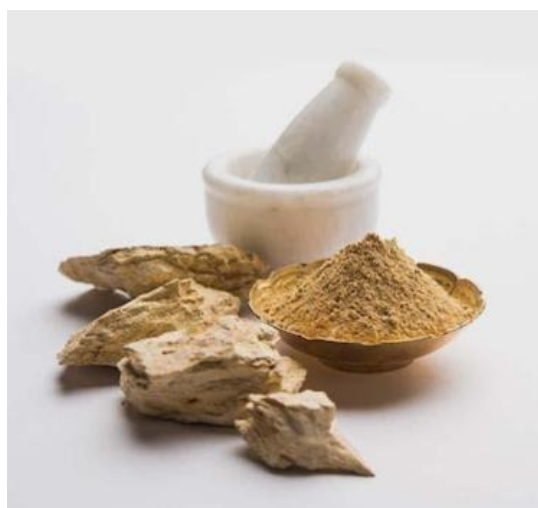
Figure 3. Multani mitti.

Multani mitti assists skin by various ways with loving decreasing pore sizes, eliminating zits and whiteheads Blurring spots, calming burns from the sun, purifying skin, further developing blood dissemination, coloring, diminishing skin inflammation and blemishes and gives a sparkling impact to a skin as they contain solid supplements (Figure 3). The mitti of Multani is rich in magnesium chloride [17].