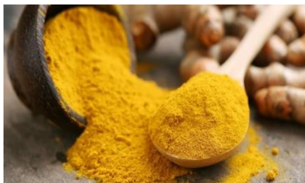
Figure 2. Turmeric.

Turmeric defers the indications of maturing like kinks, further develops skin versatility. It fixes Pigmentation, lopsided complexion and dull skin [16].