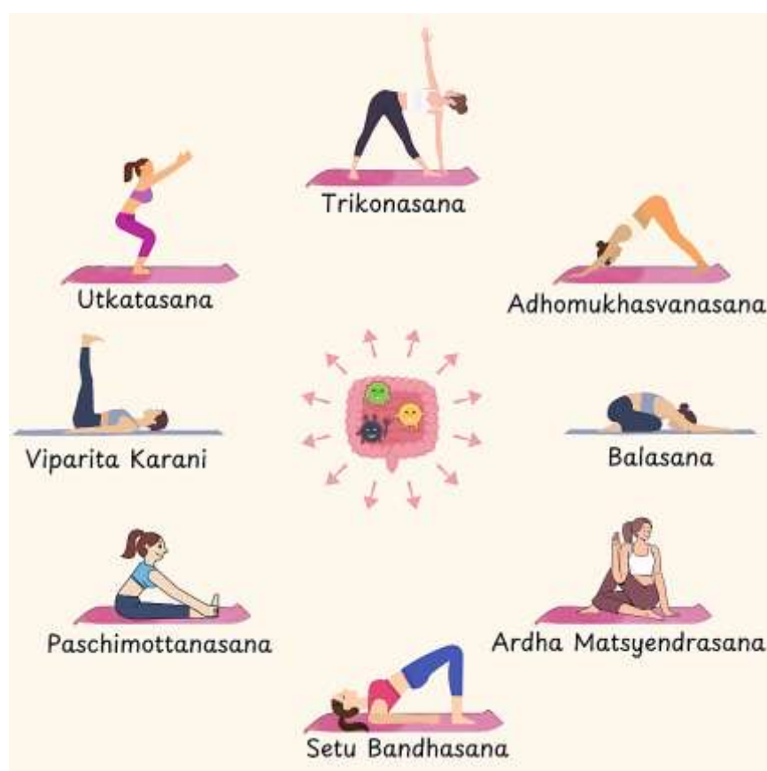
Figure 4. Yoga asanas for healthy Gut.

Additionally, research conducted by Isha Institute of Inner Sciences (McMinnville, TN) evaluated the effects of an advanced meditation program called Samyama, combined with a vegan diet high in raw foods, on the gut microbiome and metabolite profiles of 288 participants. Stool samples were analyzed at three stages: two months before the program (T1), immediately before starting (T2), and three months after completion (T3). While alpha diversity did not show significant changes between the meditators and the controls, beta diversity indicated significant shifts in microbiota of meditators post-Samyama ( p_{adj} = 0.001 ). During the preparation phase, meditators had elevated levels of branched short-chain fatty acids, such as iso-valerate ( p_{adj} = 0.02 ) and iso-butyrate ( p_{adj} = 0.019 ) at T2. These results suggest that the combination of meditation and a vegan diet can positively alter gut bacteria, with these changes persisting three months after the program. The study underscores the need for further investigation to confirm these findings and to understand the mechanisms connecting diet, meditation, and gut microbiome changes with mental health outcomes like mood regulation (Figure 4) [40].