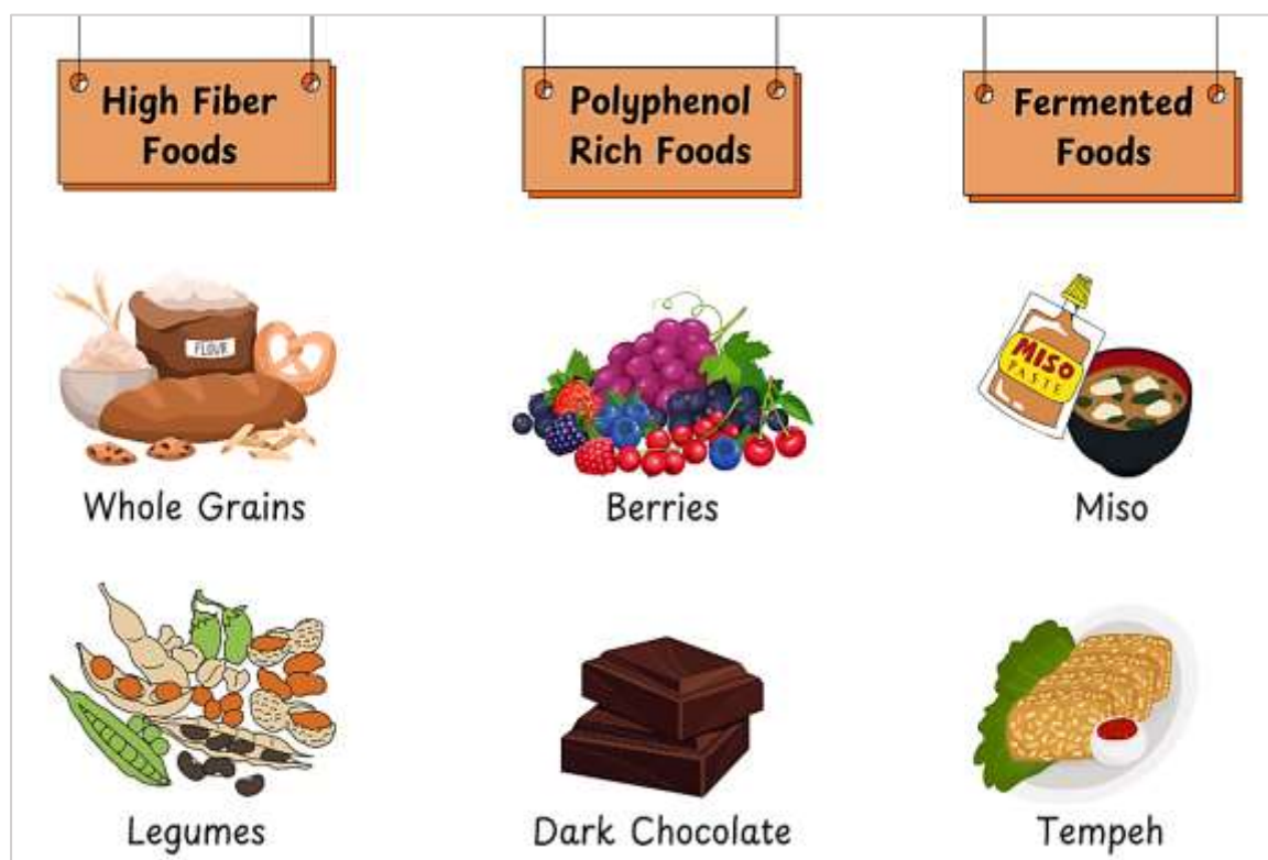
Figure 3. Examples of dietary intervention foods.