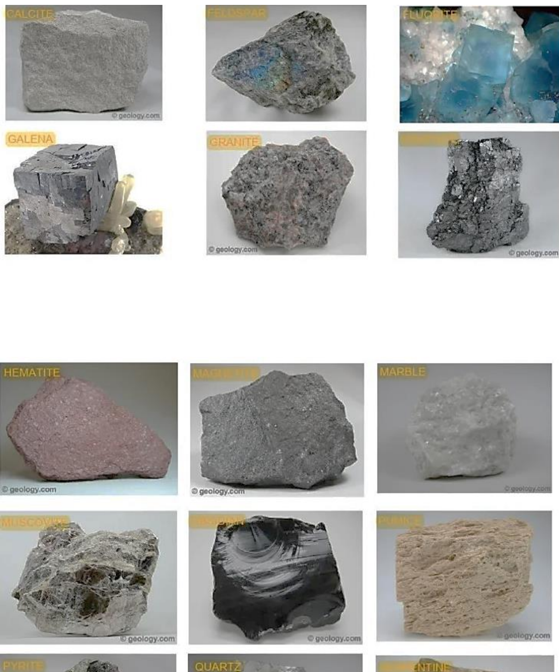
Figure 2. Minerals Identification.