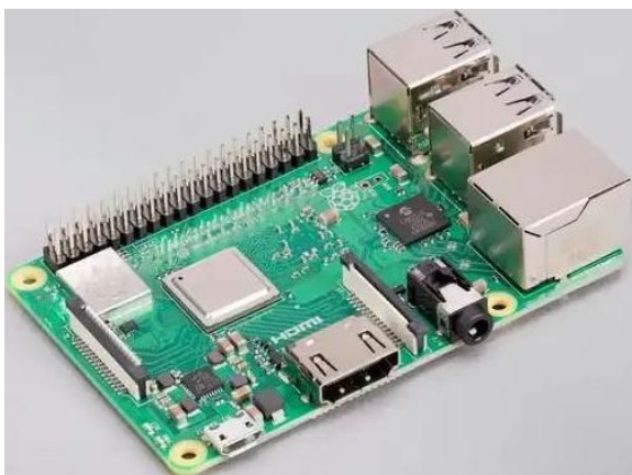
Figure 2. Raspberry Pi.

The L298N Dual H-Bridge Motor Controller is a well-liked option for regulating the rotational direction and motor speed. Motors rated for 5 to 35 V can be powered by it up to 2 A [9]. Model of motor driver is shown in Figure 3.