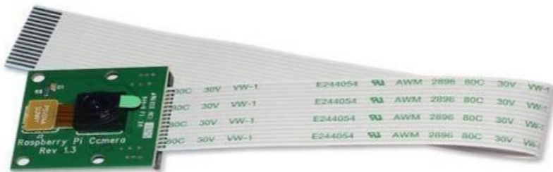
Figure 4. Pi camera.