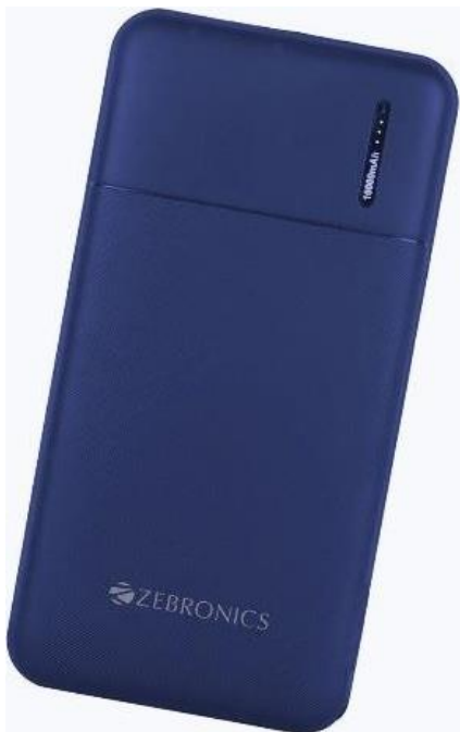
Figure 7. Power bank.