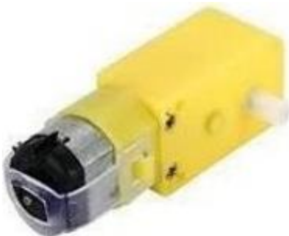
Figure 5. DC motor.