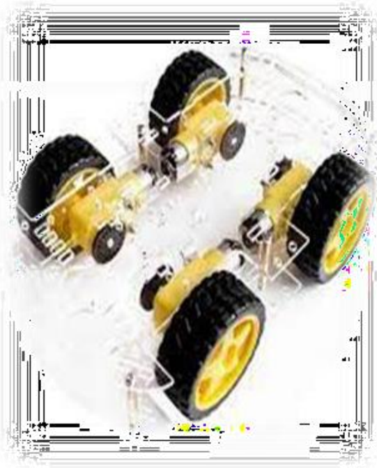
Figure 6. Car chassis kit.

Portable charging stations known as power banks are used to replenish USB-powered gadgets such as headphones, Bluetooth speakers, and cellphones. Power bank model is shown in Figure 7.