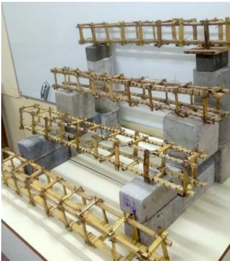
Figure 3. BRC beams with vertical strips [33].

Quality control is a must for any product to be on the market. Also, the reduction in the loss of raw materials gives added advantages to the manufacturers of any material. In the case of engineered bamboo, much research is needed for modification and inclusion of modern manufacturing processes. For example, in the present manufacturing process, the outer culm of the bamboo, which has a high fiber concentration, is rarely used. But if the manufacturing process uses this layer, then engineered bamboo with a high bending modulus can be developed [38]. The inclusion of automation in the manufacturing process is another area to explore.